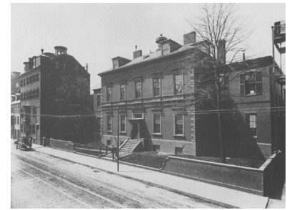
north end of charles street